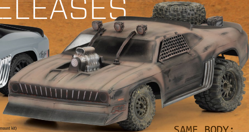
SAME BODY: DIFFERENT IMAGINATION