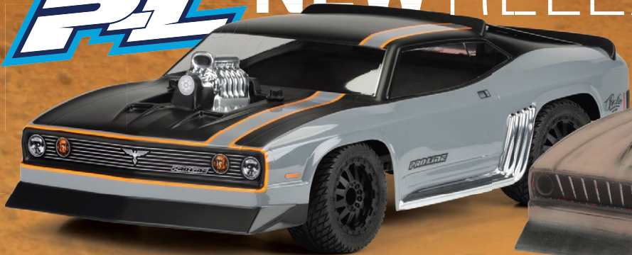
DESERT EAGLE CLEAR BODY for PRO-2 SC, Slash® 2WD/4x4, XXX-SCT, 22 SCT, Ten-SCTE/2.0, SCT410 & 1:10 Rally (requires extended body mount kit) #3463-00