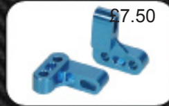
CR01-05/LB Aluminium Servo Mount