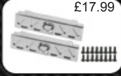
CR01-08/SI Aluminium Cross Member