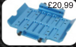
CR01-09/LB Aluminium Platform