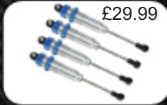
CR01-01/LB Crawler Oil Damper Set