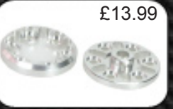
CR01-12/SI Aluminium Gear Housing