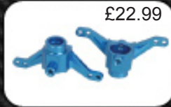
CR01-02/LB Aluminium Knuckle Arm