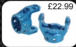
CR01-18/LB Aluminium C Hub Carrier