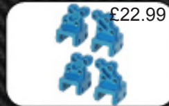
CR01-20/LB Aluminium Lower Linkage Mount