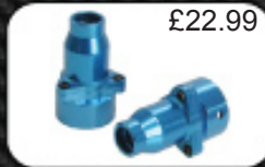
CR01-19/LB Aluminium One Piece Rear Hub