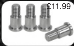
CR01-17 Titanium King Pin