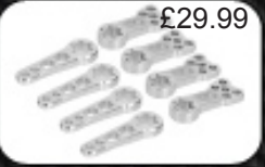
CR01-15/SI Aluminium Suspension Link Mount