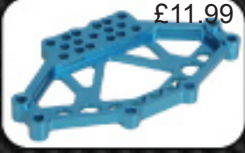
CR01-06/LB Aluminium Servo Bed