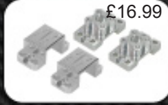
CR01-21/SI Aluminium Suspension Mount