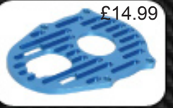
CR01-11/LB Aluminium Motor Heatsink