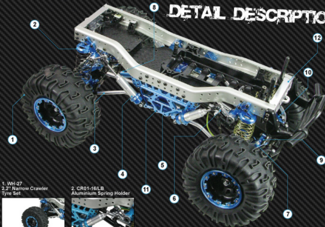
1. WH-27 2.2" Narrow Crawler Tyre Set