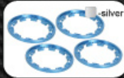
CR01-04/LB Aluminium Bead lock Ring