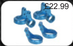
CR01-16/LB Aluminium Spring Holder