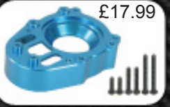
CR01-13/LB Aluminium Gear Box