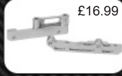
CR01-10/SI Aluminium Gear Case Mount