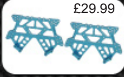
CR01-07/LB Aluminium Side Frame