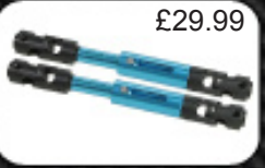
CR01-14/LB Aluminium Drive Shaft