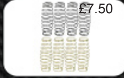
CR01-22 Aluminium Spring Set